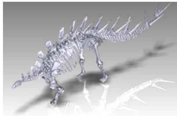
Complex 3D model used in palaeontological research

Having the protection class IP 53 means that the device is protected against splash water and dust.