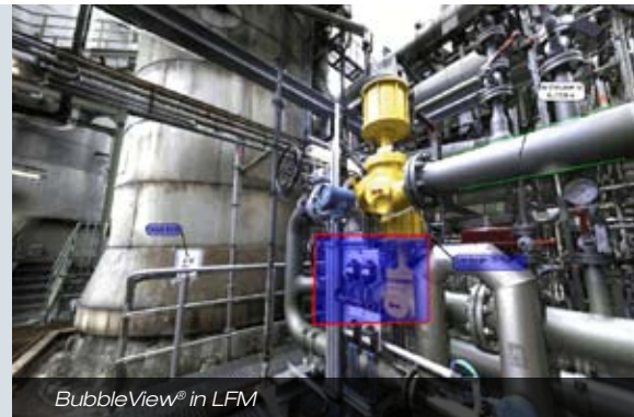
BubbleView® in LFM

This enables a subsequent comparison between the revamp design and the as-built site. One other advantage is that the scanner can operate in a temperature range of -10 °C to +45 °C.