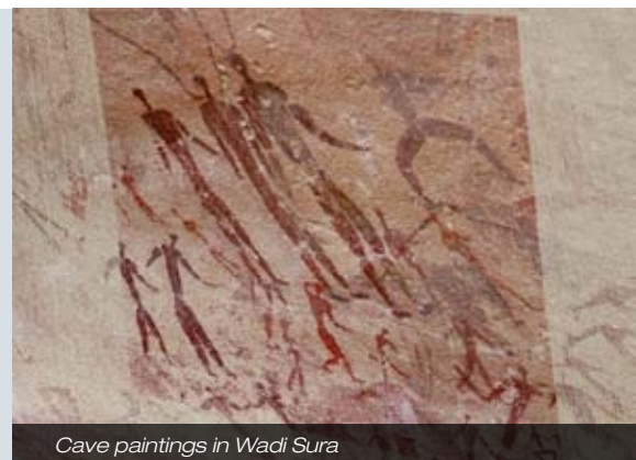
Cave paintings in Wadi Sura

The optional M-Cam can be used to capture colour information. Compared to conventional methods, much time can be saved. Unrivaled levels of precision can be achieved.