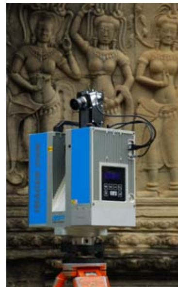
Explosion proof: IMAGER 5006EX