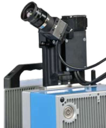
The M-Cam can be mounted effortlessly

Detailed descriptions about numerous additional accessories with can be found at www.zf-laser.com or directly at the help menu of your IMAGER 5010.