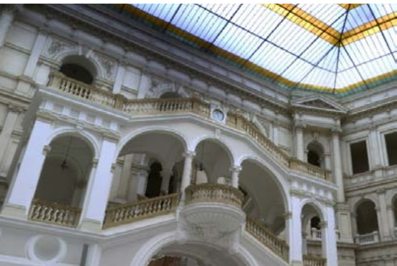
Mapped point cloud - Warsaw University

At the scene of an accident, for example, all the relevant data can be gathered very quickly without interrupting the work of the police or rescue teams. Downtimes of production plants can similarly be reduced to a minimum.