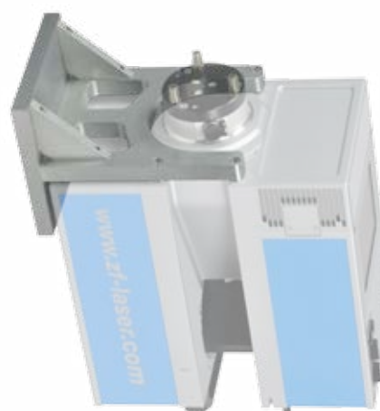
Mounting bracket for overhead use of the PROFILER available as accessory (see www.zf-laser.com ).