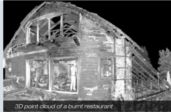
3D point cloud of a burnt restaurant

This leads to great time savings for accident reconstruction, checking plausibility where manipulation is suspected and many other purposes of insurance interest.