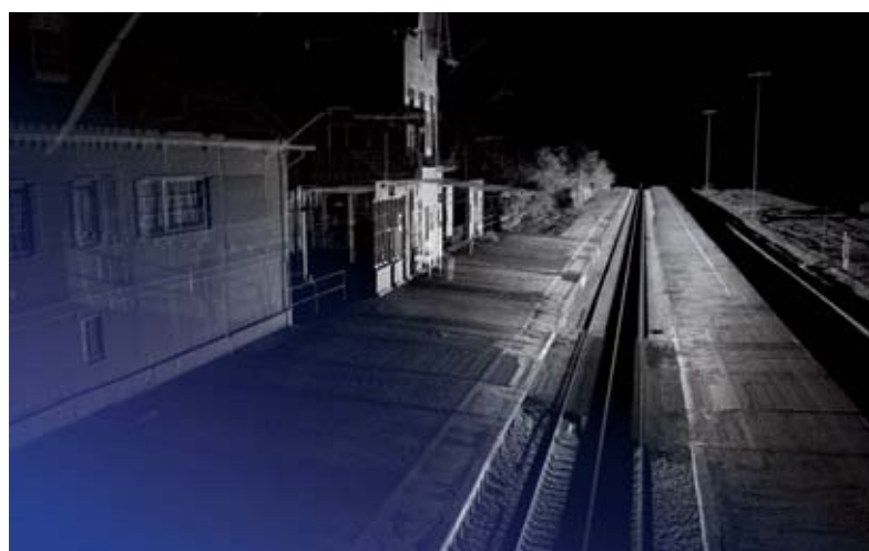
The PROFILER is also suitable for use on fast-moving mobile platforms like trains.

The PROFILER 5010 is equipped with a colour touch screen and intuitive operating concept. By just two clicks, the PROFILER 5010 can be configured and started.