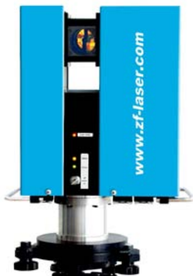
The first compact device: Z+F IMAGER 5003

In 2006, the success story of the IMAGER series was continued with the Z+F IMAGER 5006. Thanks to its integrated control panel, powerful internal PC, hard disk and internal battery, the IMAGER 5006 was the first 3D laser measuring device where the stand-alone concept was realized 100%.