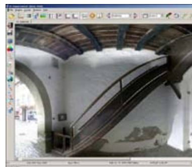
Visualization and evaluation of scan data using Z+F LaserControl. Interior view of Martin's Gate Wangen

A great variety of import and export formats are supported by LaserControl. As well as many ASCII-based exchange formats, the new binary standard formats OSF, PTG and ASTM-E57 can also be used for export.