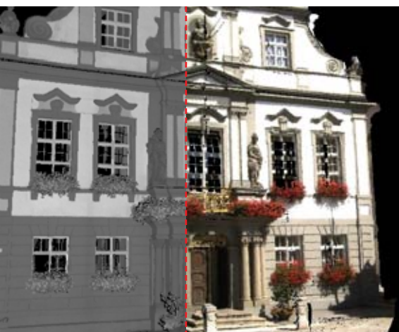
Colour mapping with M-Cam Wangen town hall