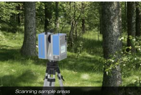
Scanning sample areas

The low noise level means that despite long distances, a very high data quality and scan resolution can be achieved and even small details can be captured.