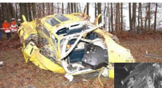
Helicopter crash Regional CID Baden-Württemberg

The protection class IP 53 means that the scanner is not affected by splash water or dust. The low measurement noise guarantees a detailed and precise evaluation of the forest land.