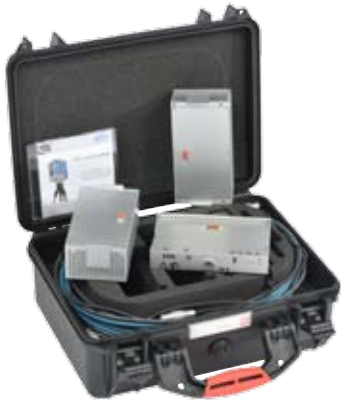
The hard case ensures the safe storage of the accessories

Every Z+F laser scanner comes complete with an accessory case that includes the following items: