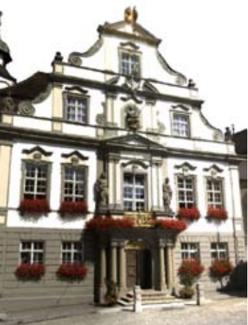
Town hall Wangen im Allgäu in 3D view

The new Z+F IMAGER 5010 is highly precise, reliable and flexible. These improvements can be appreciated in your daily work.