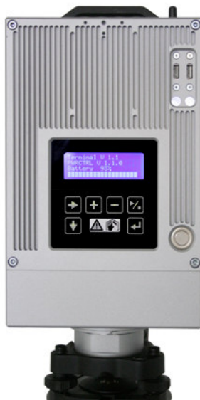
Z+F IMAGER ® , side view

The imaging 3D laser measurement systems are applicable in the fields of digital planning of factories, industrial plants, architecture, protection of historic monuments, landscape and virtual reality. They are based upon the spot Z+F Laser Measurement System LARA.