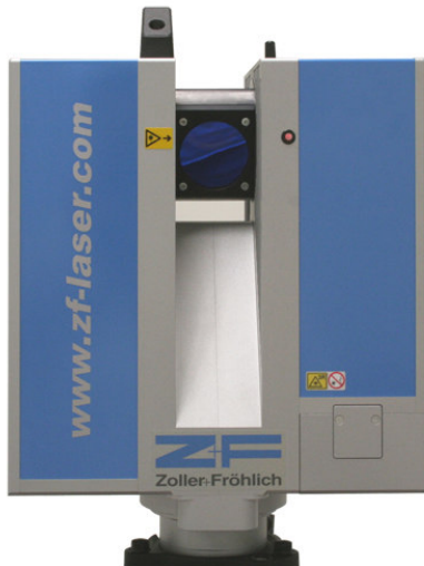
Z+F IMAGER ® , front view