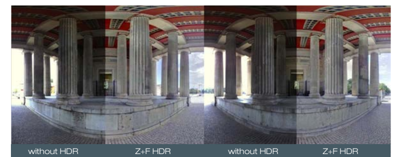
Comparison between a Z+F HDR result and a standard picture